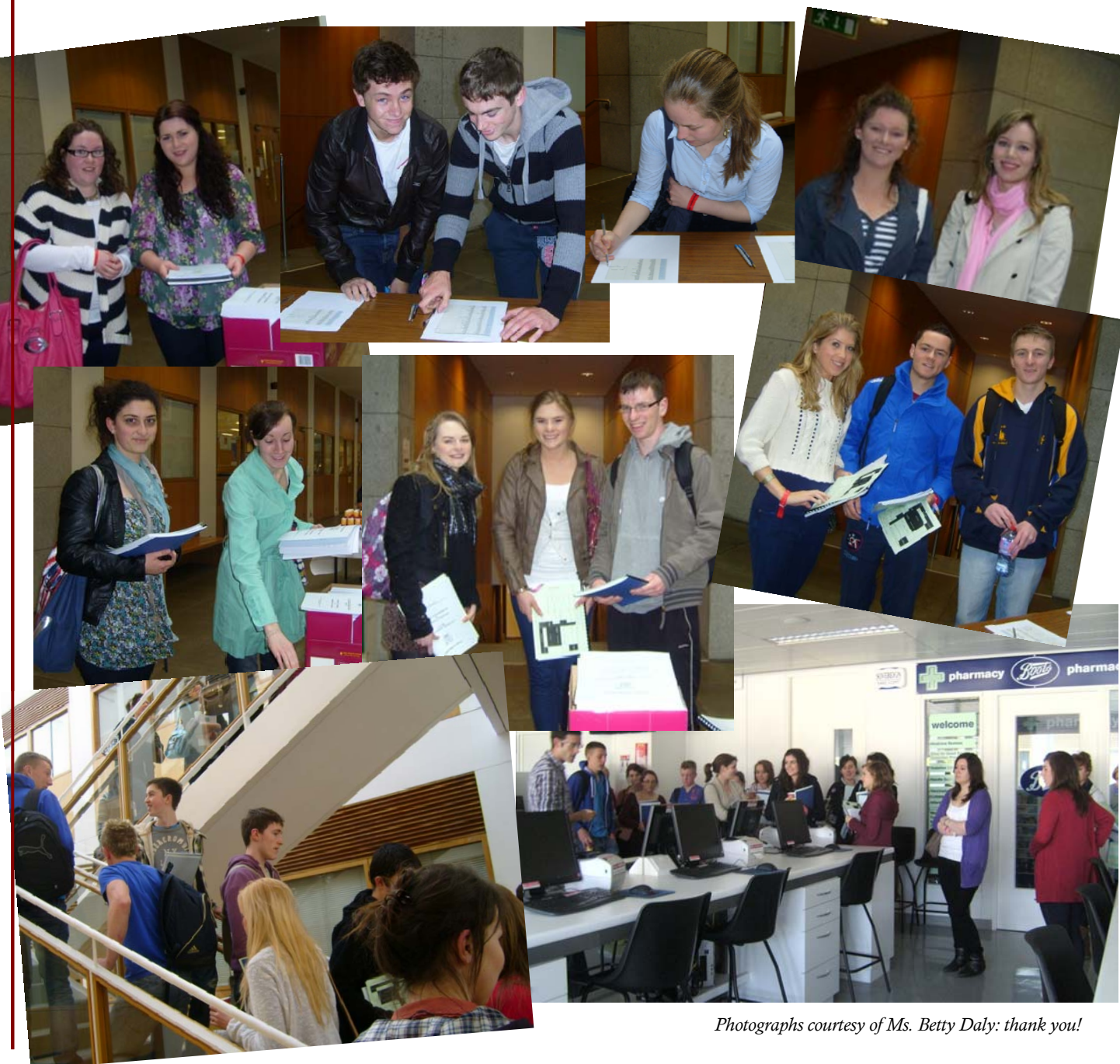
thank you!